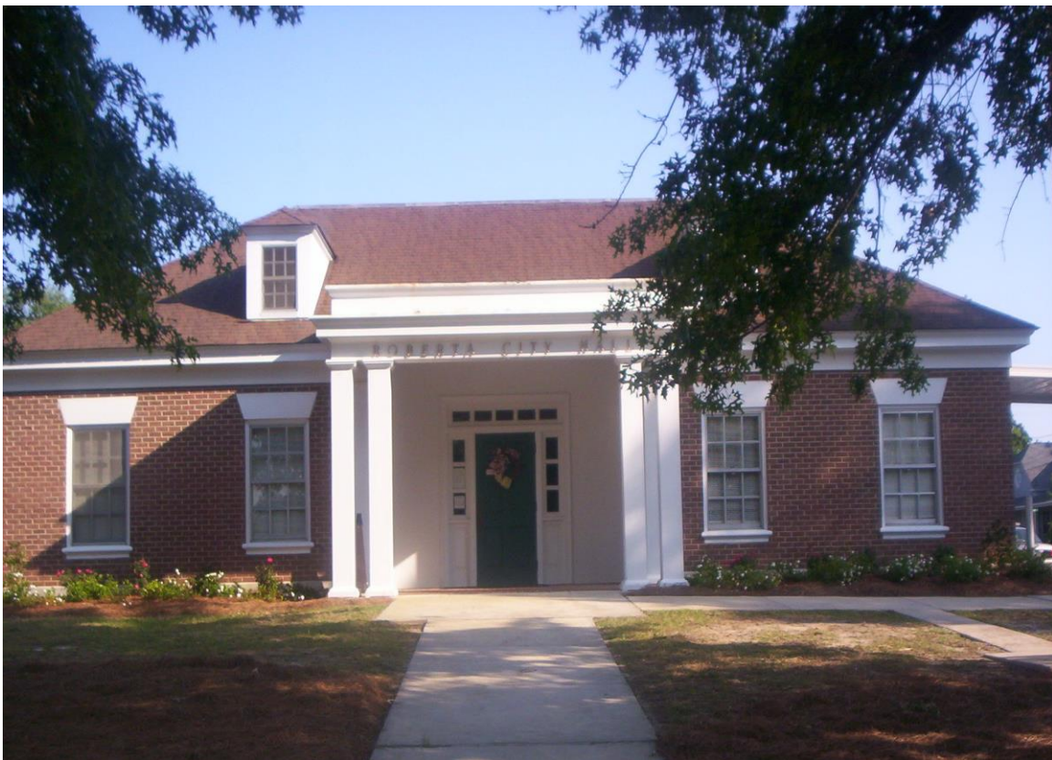
This Picture was taken 5-25-12